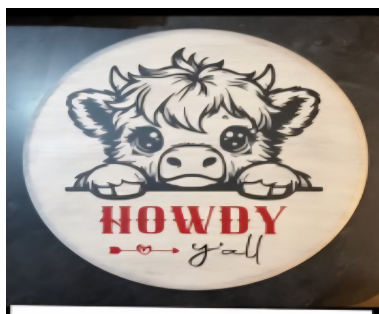
example of one of the boards

Main hall Sign up at the club See our Facebook page for more details